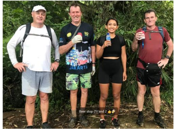
Beer stop (1) and 2 🍺🍺