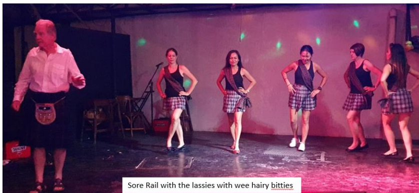
Sore Rail with the lassies with wee hairy bitties