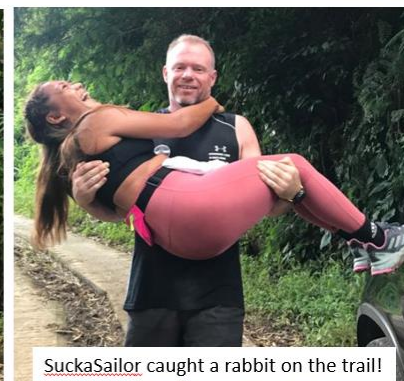
SuckaSailor caught a rabbit on the trail!