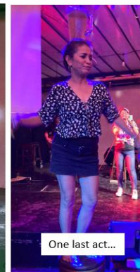
One last act...