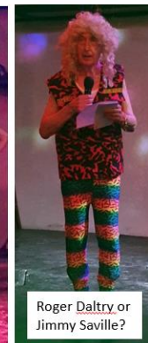
Roger Daltrey or Jimmy Saville?