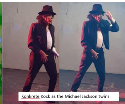
Konkrete Kock as the Michael Jackson twins